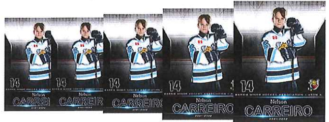
5 TRADING HOCKEY CARDS