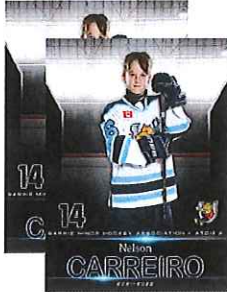
2 - 5x7 PORTRAIT PRINTS