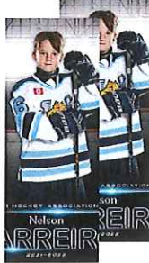
2 - BOOKMARKS