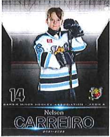
1 - 8x10 PORTRAIT PRINT